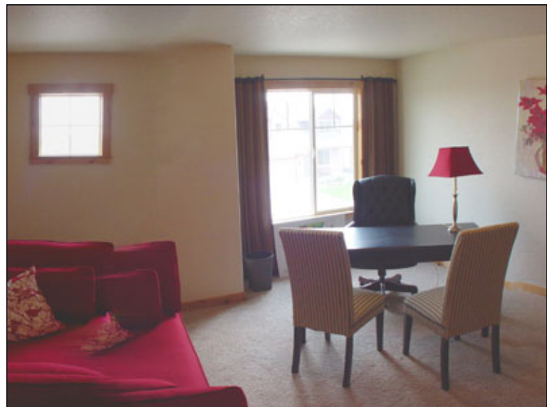
Office or 3rd bedroom Stain/natural trim

Please contact the builder for more information Zachariah Satrang * 970.686.6861 * info@ZTSHomes.com Destiny Masters * 970.686.6861 * info@ZTSHomes.com